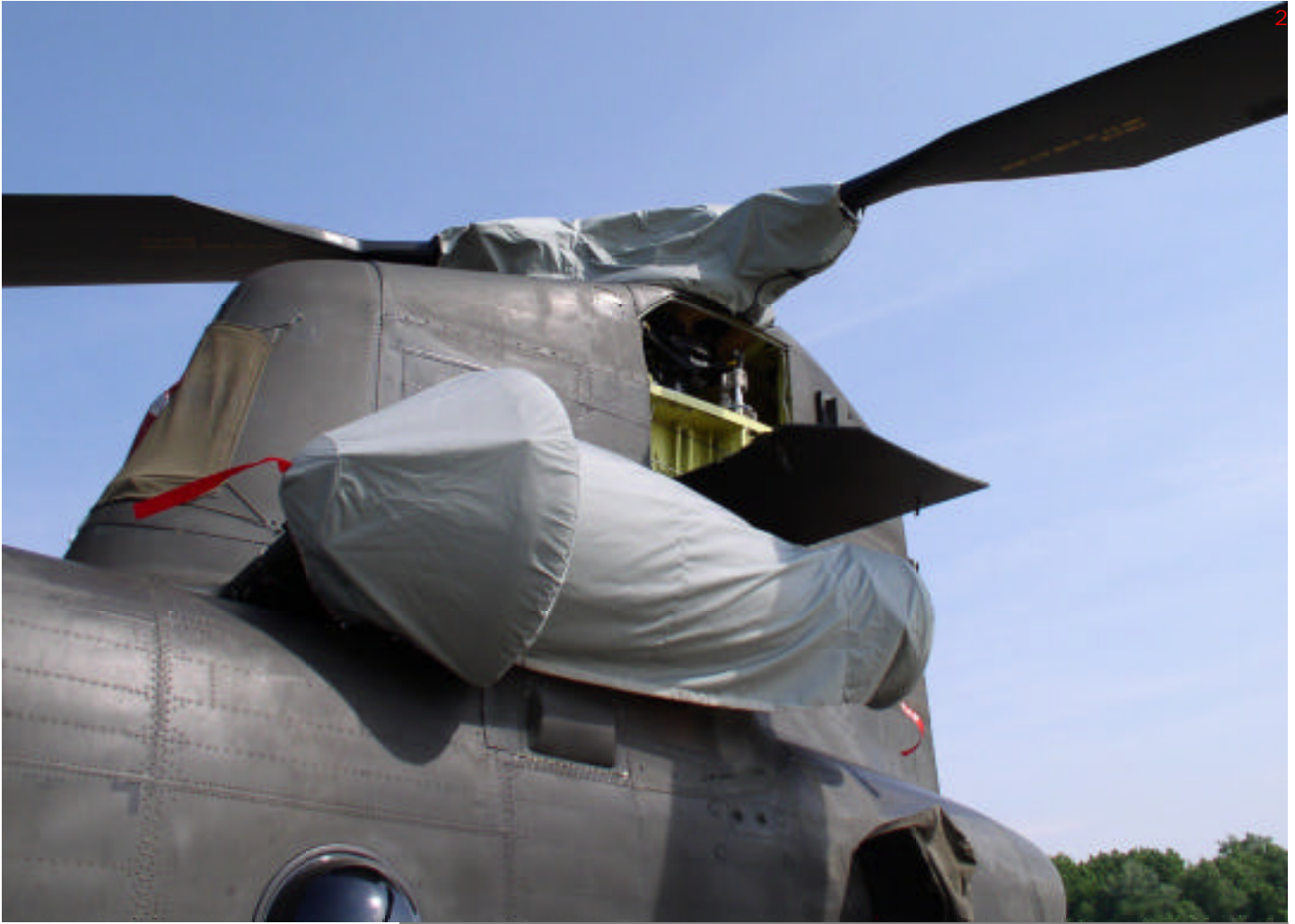
Engine and Rotor Head Covers