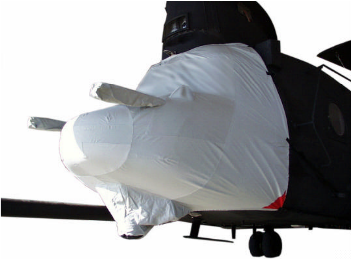
Forward Cabin/Nose Cover